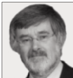
By Malcolm Lawrence (Fellow)*

0.1 There were important developments relevant to the topic of Toxic Priority which achieved high profile in the 12 months to September 2013, and some with a lower profile but perhaps not much less importance in Quarter 4 of 2013. This paper 1 is intended to pull them together to help readers to take an action-oriented view of the implications flowing from this complex topic.